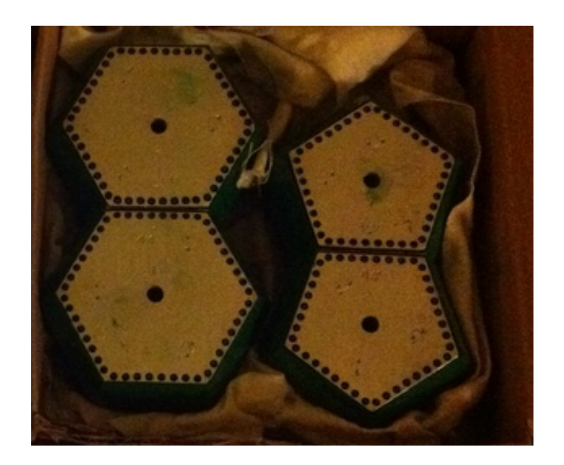
Figure 1: Traditional 2-Hexagon and 2-Pentagon Dies