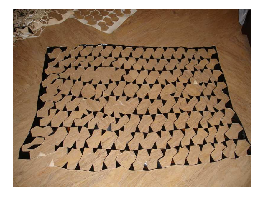
Figure 3: Laminated Rexine Wastage, Pentagons, Traditional Die

Notes: Figure displays laminated rexine wastage from cutting pentagons with the traditional two-pentagon die.