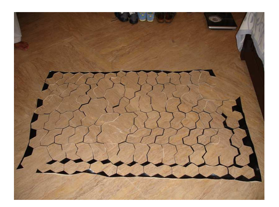
Figure 2: Laminated Rexine Wastage, Hexagons

Notes: Figure displays laminated rexine wastage from cutting hexagons with the traditional two-hexagon die.