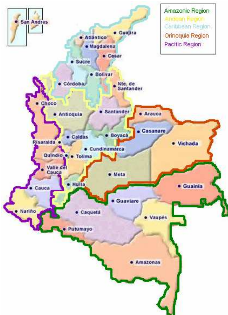
Figure 1: Political and regional division of Colombia