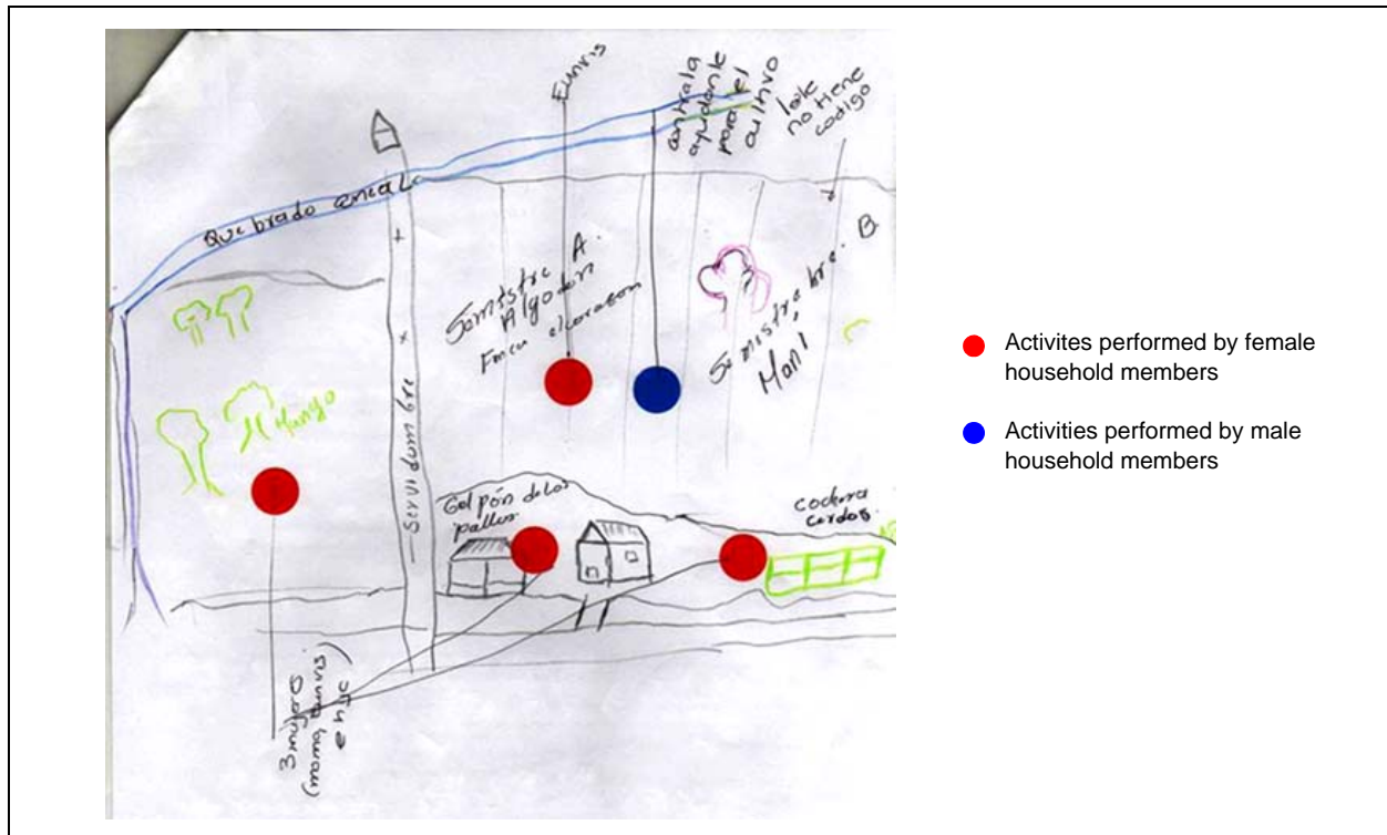
Figure 2. The farm map, drawn by E.

less labor could create more unemployment. Some women reported that knowing their plots would not be attacked by bollworms was “priceless” because of peace of mind.