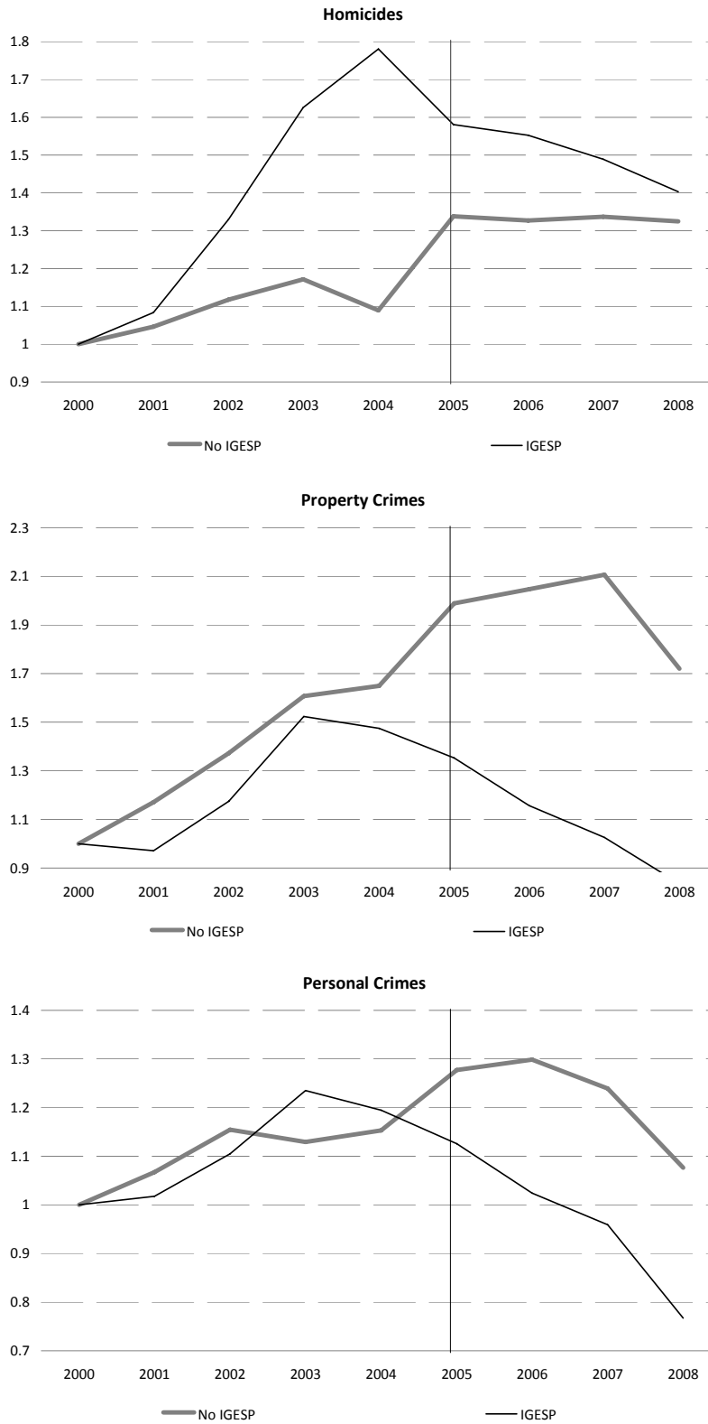
Figure 2: Evolution of Crime Rates for Municipalities With and Without IGESP in 2008 – Minas Gerais, Brazil – 2000-2008 (weighted averages normalized to 1 in 2000)